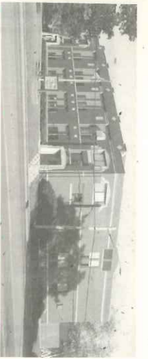
1. Community Center (Langlade County Teachers Training School) - 411 Superior Street (1925/26) at a cost of $53,440, teachers trained there through 1971. Built of Bedford stone, it included a gymnasium with a spectator balcony, an auditorium, and classrooms. It now houses the Langlade County Department on Aging.