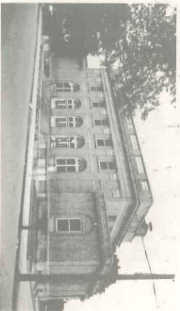
6. U.S. Post Office - 501 Clermont Street - (1915) At a cost of $60,000, it is one of 27 post offices in Wisconsin to be placed on the National Registry of Historic Places. It looks virtually the same now as it did when it was built.