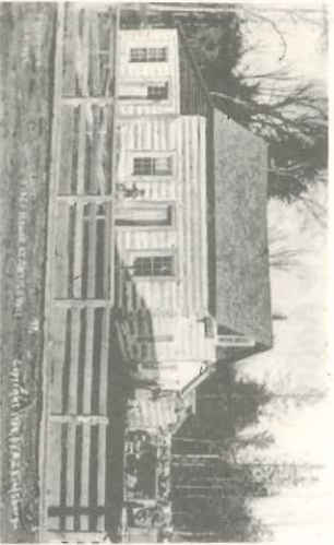
3. Deleglise Cabin - 404 Superior Street - This is the first home erected in Antigo for Francis Deleglise in 1878 on the banks of the Springbrook. In 1916 the cabin was moved to the grounds of the library. Preservation and restoration continues.