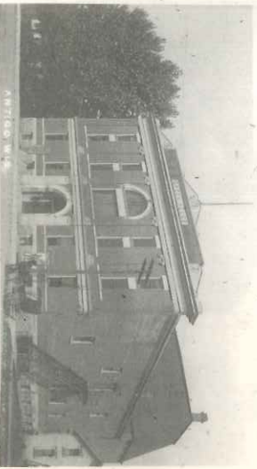
12. Opera House - 1016 Fifth Avenue - 1905 - It was home to many forms of entertainment. It had a seating capacity of 1100 and a stage that could accommodate 50 people. During WWI, it became an armory; now it is an apartment house.