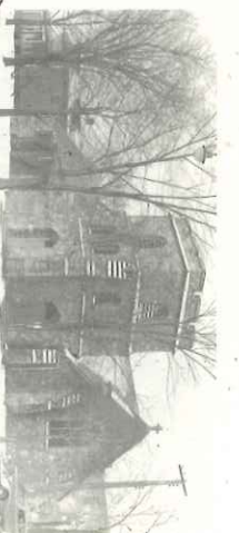
7. St. Ambrose Episcopal Church - 502 Clermont Street - (1908) It was first used on Easter, 1909. The Tudor Gothic style stone church has interior carved figures imported from Germany.