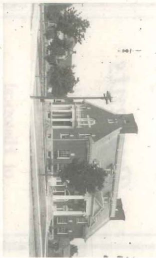
2. Langlade County Historical Society Museum (Carnegie Library) - 404 Superior Street (1903/05) Funded by an Andrew Carnegie grant, it was designed by Alan Conover, a prominent Wisconsin architect. It is one of the few Carnegie libraries still intact.