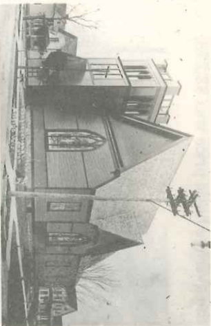
15. Faith United Church - 628 Clermont Street - This church dates from 1883 and has been home to two Unity congregations who merged and became Faith United. It contains the altar and font brought from the old Evangelical and Reformed Church.