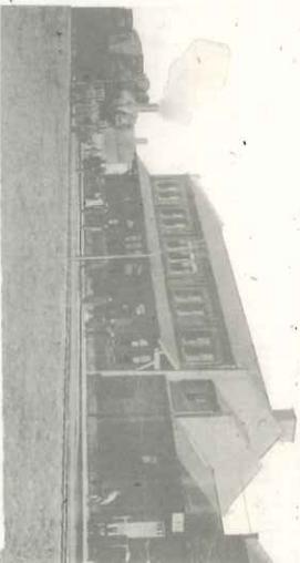
9. Depot - 524 Morse Street - This three-part building was one of several buildings the Chicago and Northwestern Railroad built in Antigo. There were warehouses, a pump house, icehouse, blacksmith shop, roundhouse, and others. Antigo was a major rail hub. The remaining building was remodeled in the 1990s for residential and business use.