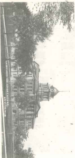
14. Langlade County Court House - 800 Clermont Street - (1905) - Built of Port Wing brownstone at a cost of $71,080, this building is on the National Historic Registry. It was recently renovated and displays beautiful woodwork and murals. The copper dome also was refinished.