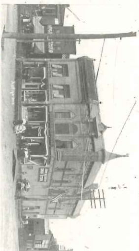
8. North Quarter - 737 Fifth Avenue - Built as a grocery by H.L. Ferguson in 1888, it also housed the Odd Fellows Lodge on the second floor. From 1901 until the late 1900s, it housed McCarthy's and later Vosmek drug stores.