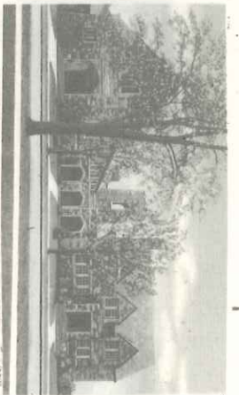
13. St. Hyacinth's Church - 819 Third Avenue - Known as the Polish church for many years, it was established in 1895 and replaced in 1934 by the present structure. It is English Tudor Gothic Style with a Queen Anne style rectory. It is now home to a combined parish composed of St. Mary's and St. Hyacinth's.