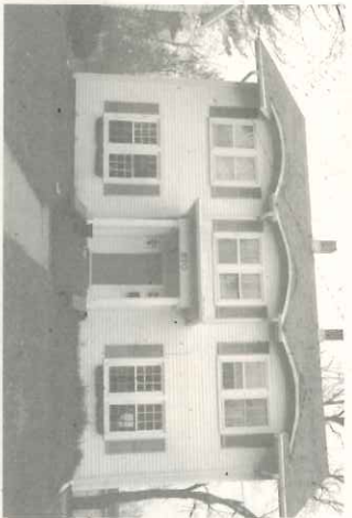
5. Sears Roebuck Kit House - 810 Seventh Avenue - This is one of several "kit" homes in the area. In the late 1800s and early 1900s, several companies made these kits for all types of buildings. They would ship components by rail in the order of use for construction. Prices varied with the extras ordered, but the average basic price was $3,278.